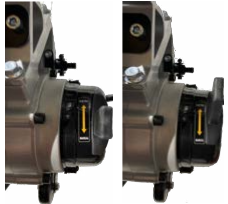
Figure 5. Pull out your anti-tip wheels by pushing the switch on the side rail pulling out the anti-tip wheels in the outwards most position. Make sure that the anti-tip for both wheels are extended outwards and locked into place.

Figure 4. Switch the drive levers located behind each rear wheel from manual mode to drive mode, by pushing forward (one behind each wheel). This will lock your wheelchair into place.