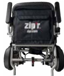
Figure 2. Place one hand on the frame at the front of the seat and your other hand on top of the padded backrest. Pull the two halves of the wheelchair apart while lifting to unfold the wheelchair.

Figure 1. Remove the Zip'r Transport Pro from the packaging placing the wheelchair on the ground with the wheels facing down.