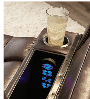
Right Arm: Cup Holder & Storage Compartment

The Rhea comes standard with the following comfort and convenience features: