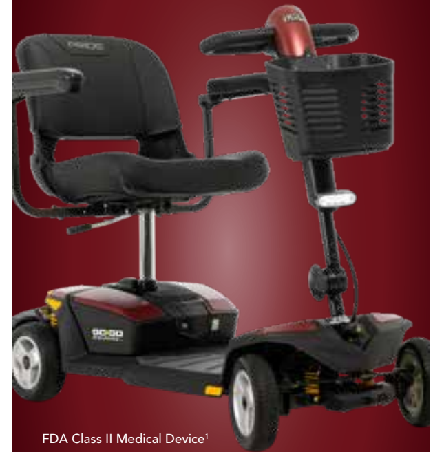
FDA Class II Medical Device 1

DISCOVER THE PORTABLE POWER OF LITHIUM ION