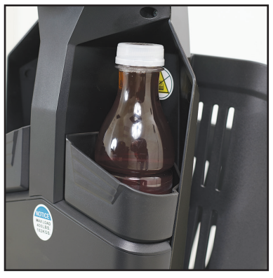
Conveniently located drink holders