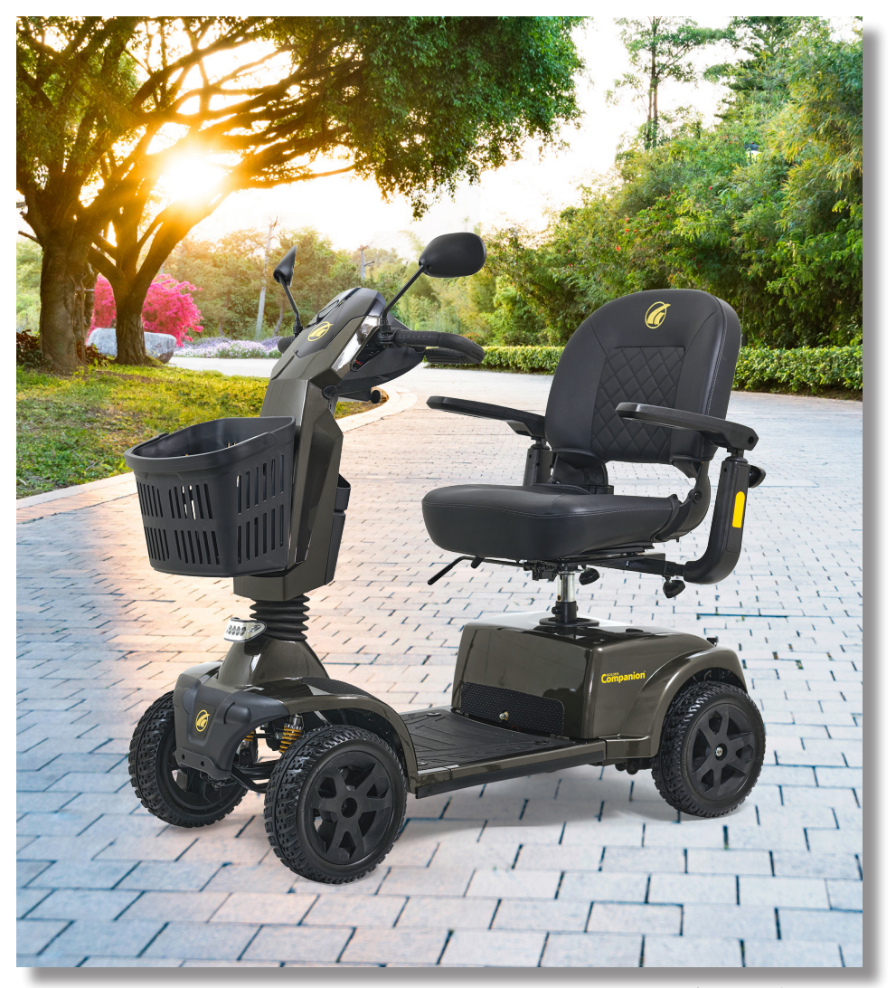
Shown in Galactic Grey