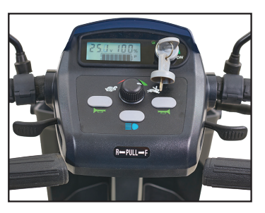
Digital Dashboard & User-friendly auto-tiller adjustment