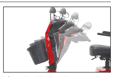
Infinite adjustable tiller with ergonomic design