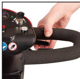
User-friendly auto-tiller adjustment