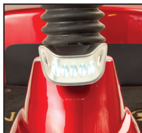
Front and rear lights and side reflectors for safety