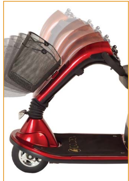
Patented infinite adjustable tiller