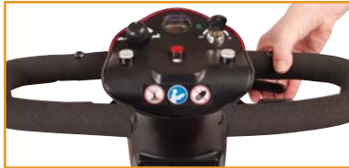
EZ Reach tiller adjustment