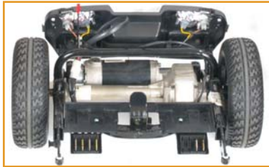
Quiet & maintenance free motor