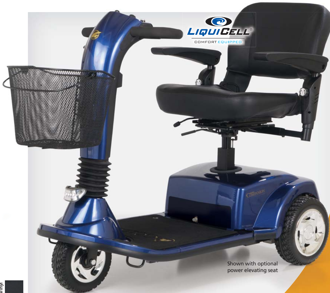
Shown with optional power elevating seat