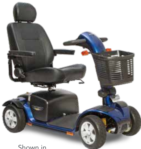
Shown in Viper Blue

The Victory ® Sport incorporates a sporty design with extra comfort and performance features for a truly unique ride experience. With a maximum speed of 8 mph—the fastest within the Victory Series—this scooter will accelerate your active lifestyle. Standard features include feather touch disassembly, wraparound delta tiller, 10" solid tires, front and rear suspension, high-back reclining seat, directional signals, a high-intensity LED lighting package, an easy-to-read LED battery meter, and a front basket. Available in Viper Blue and Candy Apple Red.