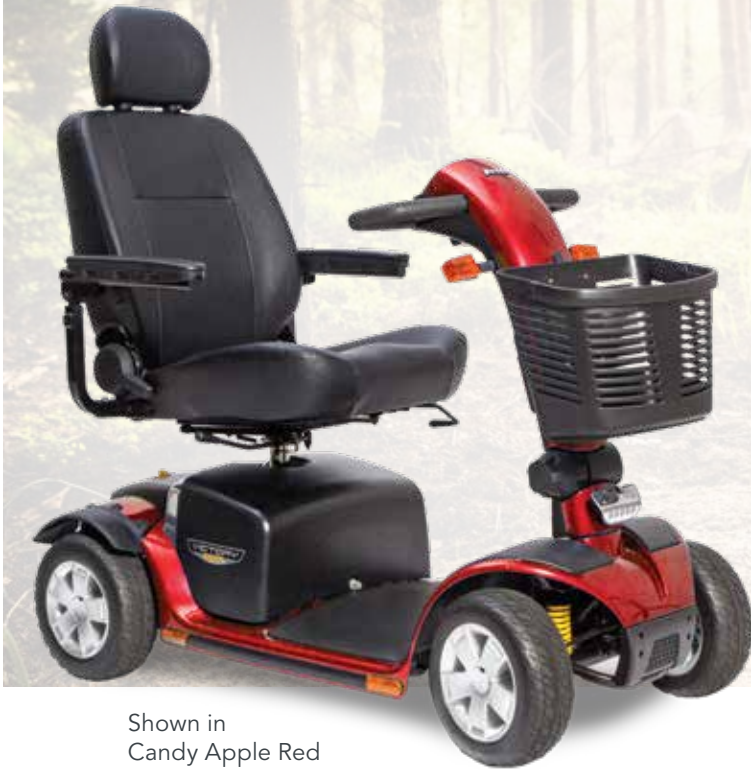
Shown in Candy Apple Red