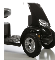
LED lighting system