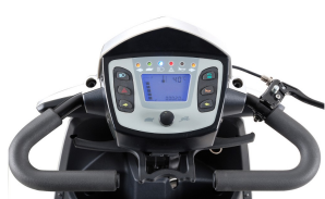
Digital LCD dashboard display