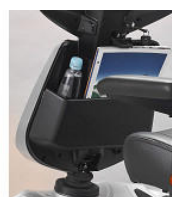
Tiller storage space