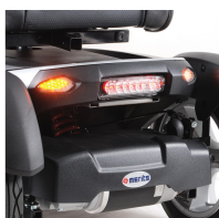
LED lighting system