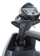
Mecha lock tiller