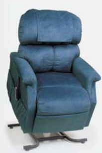
Comforter Junior Petite PR-501JP