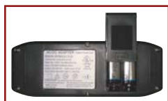
Battery Backup System

Sizes may vary depending on fabric, filling material, upholstery and carpet thickness. All measurements taken on concrete floor using levels and metal rulers.