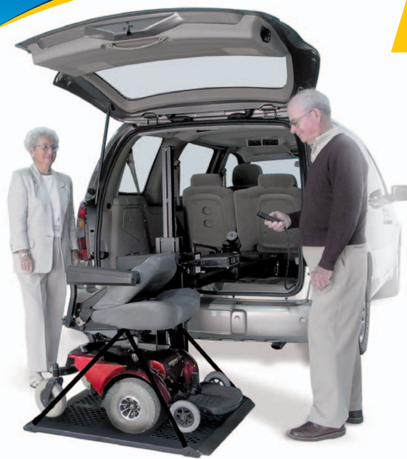
Model AL600 Shown

H armar Mobility designs, engineers and produces American made lift and ramp products that enhance people's mobility, independence and quality of life. Our products include a complete line of Auto Lifts and Access Ramps.