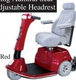
Candy Apple Red

Please see the Accessories & Options brochure for a complete listing.