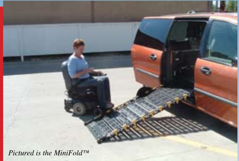
Pictured is the MiniFold™

Strength. Flexibility. Together At Roll-A-Ramp® we believe that “Without access you are not truly mobile”