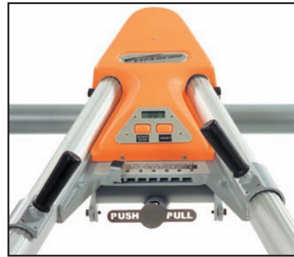
Console containing intensity lever and digital pulse monitor/timer