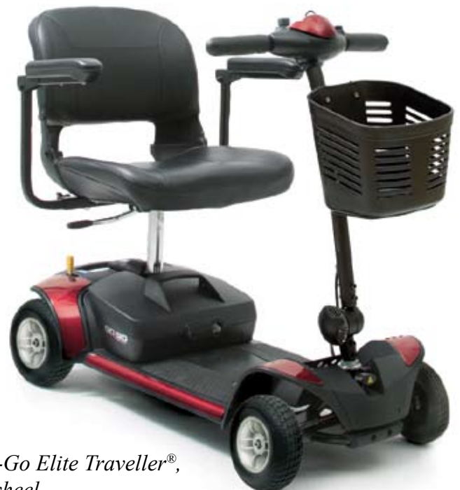
Go-Go Elite Traveller® , 4-wheel