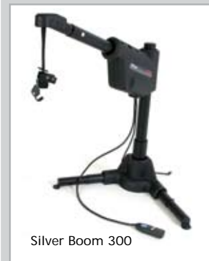
Silver Boom 300