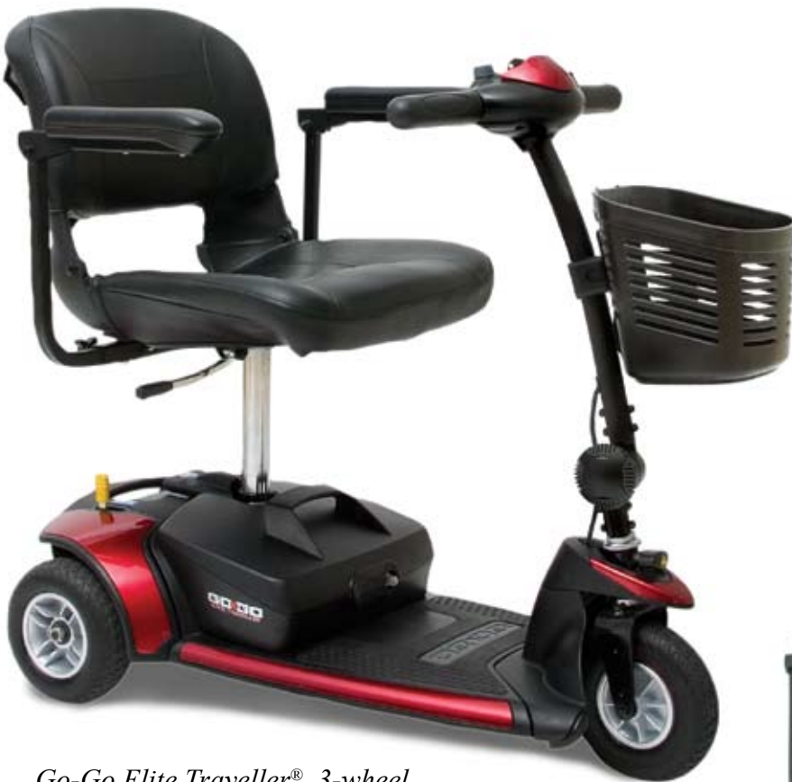
Go-Go Elite Traveller® , 3-wheel

The Go-Go Elite Traveller®'s compact design allows it to easily maneuver in tight spaces while providing stable outdoor performance. Take the guesswork out of travel with simple, one hand Feather-touch disassembly. Go where you want to go, easily, with the Go-Go Elite Traveller.