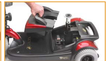
Step 2: Pull off the battery pack!