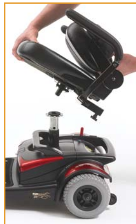
Step 1: Pop off the seat!

Changing shroud colors is a snap with three complete sets of shroud panels in Red, Blue and Sahara.