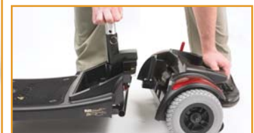
Step 3: Push apart the frame!