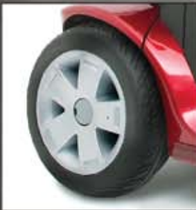
Pride's exclusive stylish, light weight, non-marking low profile wheels