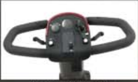
Delta tiller with wraparound handles

The sleek, sporty Victory® 10 scooter delivers high performance operation, all-new features and feather-touch disassembly. With a full complement of advanced standard features like exclusive low-profile tires, LED battery gauge, and wraparound delta tiller, the Victory® 10 is a greater value than ever before.