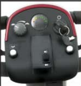
New LED battery meter for increased visibility