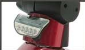
Long-lasting, high-intensity LED headlight offers optimal pathway illumination