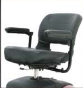
Lightweight seat with foam inserts and sliders