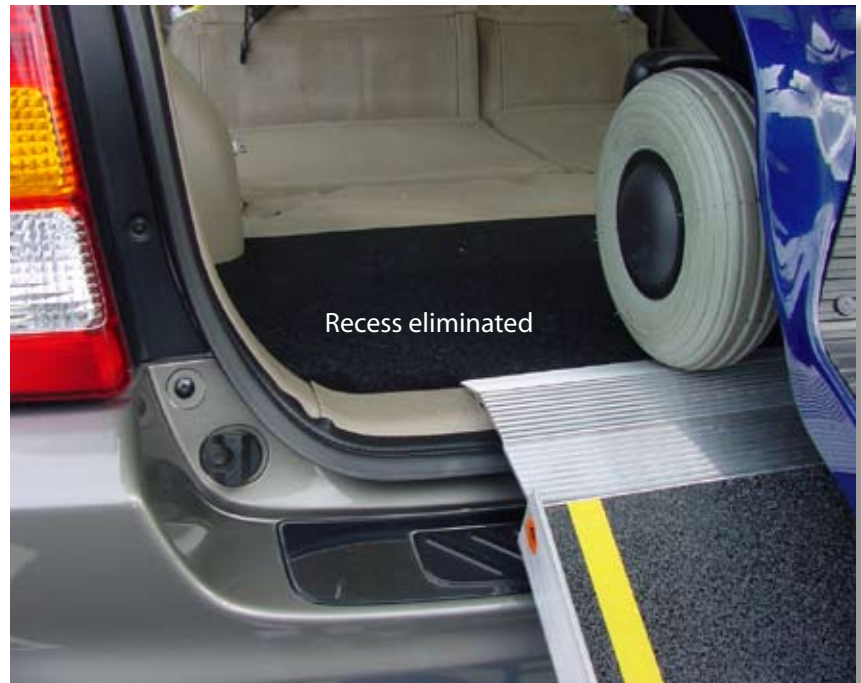
CARGO WEDGE shown with an Advantage Series SUITCASE ramp with the TLE option

The rubber CARGO WEDGE™ is the ideal solution when recessed cargo areas leave you in a rut. Without altering the vehicle, the CARGO WEDGE compensates for the difference between the rear door threshold and the lower-level cargo area, allowing mobility equipment to be loaded/unloaded with a smooth transition. The CARGO WEDGE, when used in conjunction with the Advantage Series® SUITCASE®, TRIFOLD®, or HITCHhiker™ Ramp, provides the perfect transport system for mobility access. Slip-resistant and made of 100% recycled tires.